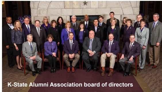
K-State Alumni Association board of directors